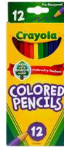
Colored Pencils lápices de colores