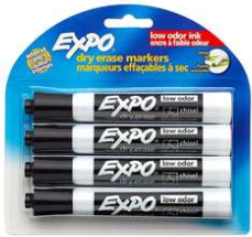
Dry-Erase Markers marcadores de expo