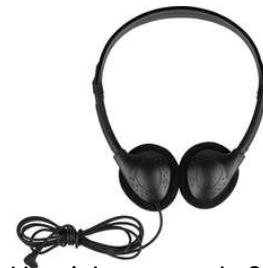
Headphones with Cord auriculares con cable