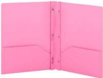
Plastic Folder with Prongs carpeta de plástico con broches