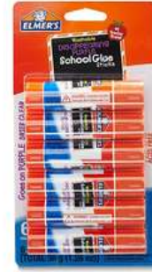
Glue Sticks barras de pegamento